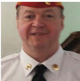
Kevin O Leary