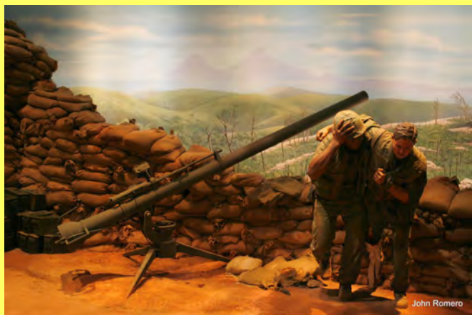
Khe Sanh Marine Corps National Museum