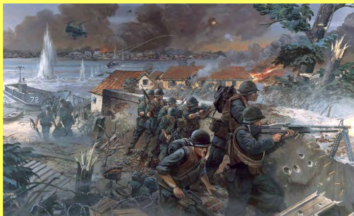
Battle for Hue City Marine Corps National Museum