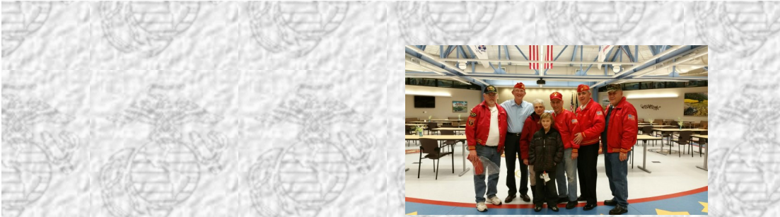
March Bingo representatives from 744